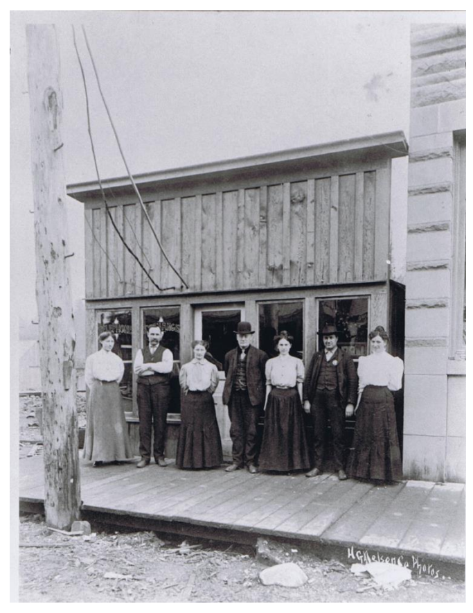
Tenino's first phone company building about 1909. It was located on Sussex, east of the Miller Building.

Other McClellan businesses included a creamery, a lumber mill, and a shingle mill.