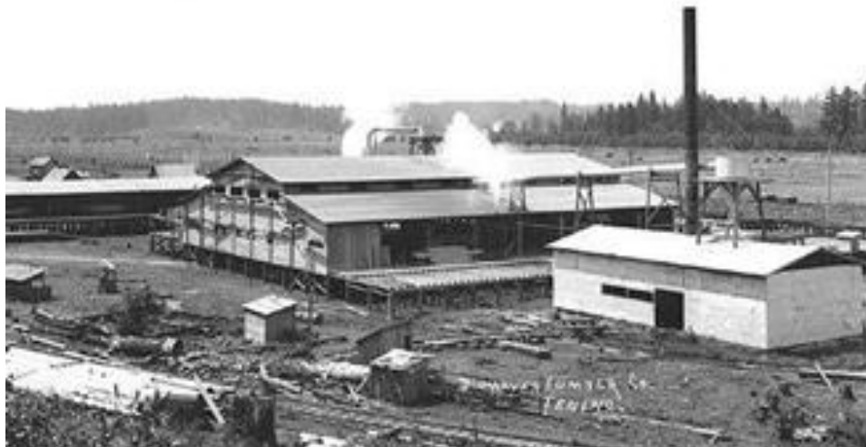
Blumauer Lumber Company about 1910 at the western foot of Blumauer Hill. It was taken over by the Skookum Lumber Company in 1916.