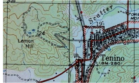
USGS Map, 1944